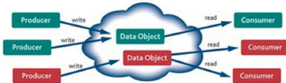
Figure 2. Example QoS capabilities and requirements for publishers and subscribers.

As another example, the Insitu ScanEagle long endurance UAV uses DDS on the vehicle itself and in the ground control stations (Figure 2). On the airframe, DDS connects the flight computers, sensors, and onboard application computers. Within the ground station, DDS connects the systems that decode data feeds, analyze the UAV's situation, and interface to the operator control. DDS implements a hierarchical control network with well-controlled data flows. This allows Insitu, for instance, to seamlessly switch control between multiple ground stations and to reliably connect to the aircraft over unreliable low-bandwidth links.