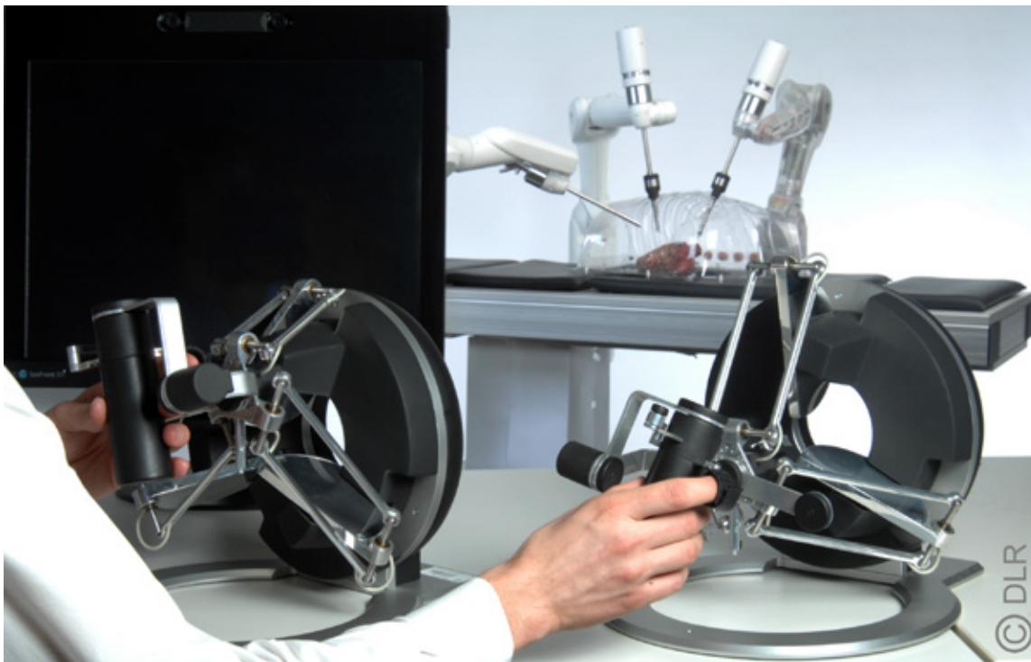
Figure 1: The MIRO Lab MIRS system

RMC is a world leading robotics research cluster and the competence center for DLR research and development in the areas of robotics, mechatronics, and optical systems. RMC specializes in the interdisciplinary design, computer-aided optimization, simulation and implementation of complex mechatronic systems and human-machine interfaces.