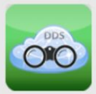
Cloud Discovery Service