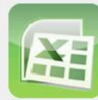
Spreadsheet Add-in for Microsoft Excel®