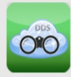
Cloud Discovery Service