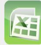
Spreadsheet Add-in for Microsoft Excel®