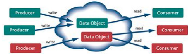
Figure 2. Example QoS capabilities and requirements for publishers and subscribers.

As another example, the Insitu ScanEagle long endurance UAV uses DDS on the vehicle itself and in the ground control stations (Figure 2). On the airframe, DDS connects the flight computers, sensors, and onboard application computers. Within the ground station, DDS connects the systems that decode data feeds, analyze the UAV's situation, and interface to the operator control. DDS implements a hierarchical control network with well-controlled data flows. This allows Insitu, for instance, to seamlessly switch control between multiple ground stations and to reliably connect to the aircraft over