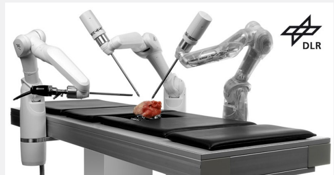
Figure 2. Three MiroLab robots coordinated through RTI Connex DDS software

For future deployment, RTI offers Connex DDS Cert as a safety-certifiable DDS implementation. This ensures that researchers have a clear path from the laboratory to future field deployments without complete re-engineering.