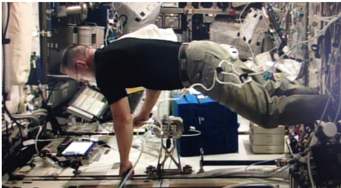
Figure 3. NASA astronaut Berry Wilmore executes first ever force-feedback experiment in space

In January 2015, NASA astronaut Berry Wilmore executed the first ever force-feedback measurement experiment on the International Space Station. The system and experiment were successful. Equally important, the SPAN development platform validated its ability to deliver a real-time, space-based telerobotic system.