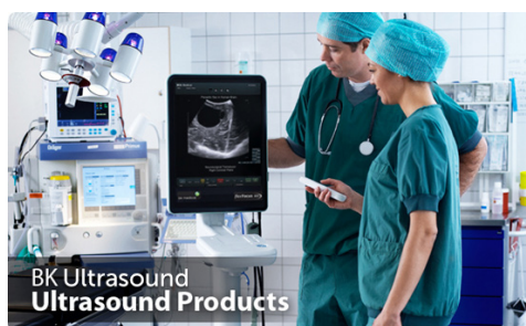
Figure 1. Modern standalone ultrasound system.

Part of the process of distributing an ultrasound system requires determining how much of the existing standalone system can be deconstructed into constituent elements while retaining functionality, reliability and performance. This might include the transducer for obtaining the data, the algorithmic engine for processing data, the display device for presenting images and the integration with back office systems. (Fig. 2)